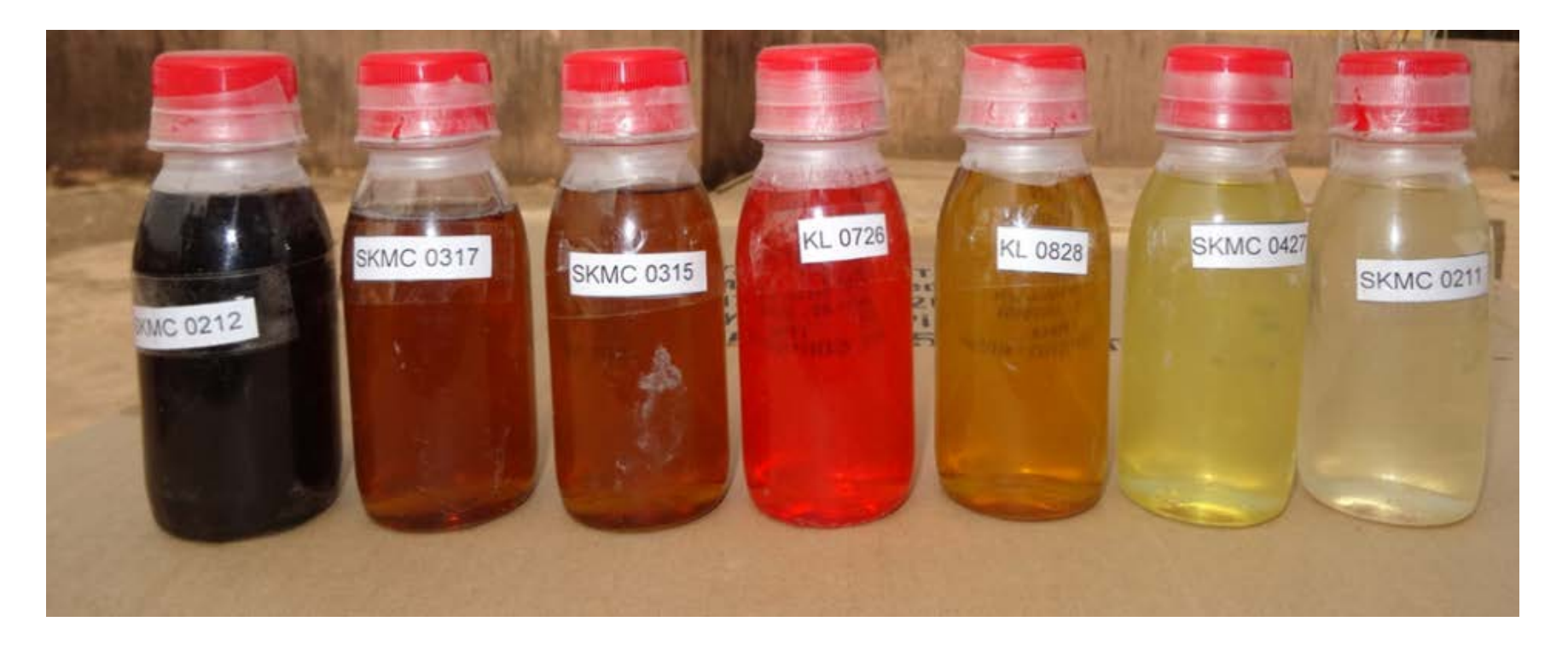
Figure 5. Glyphosate samples: same active ingredient, differing contents