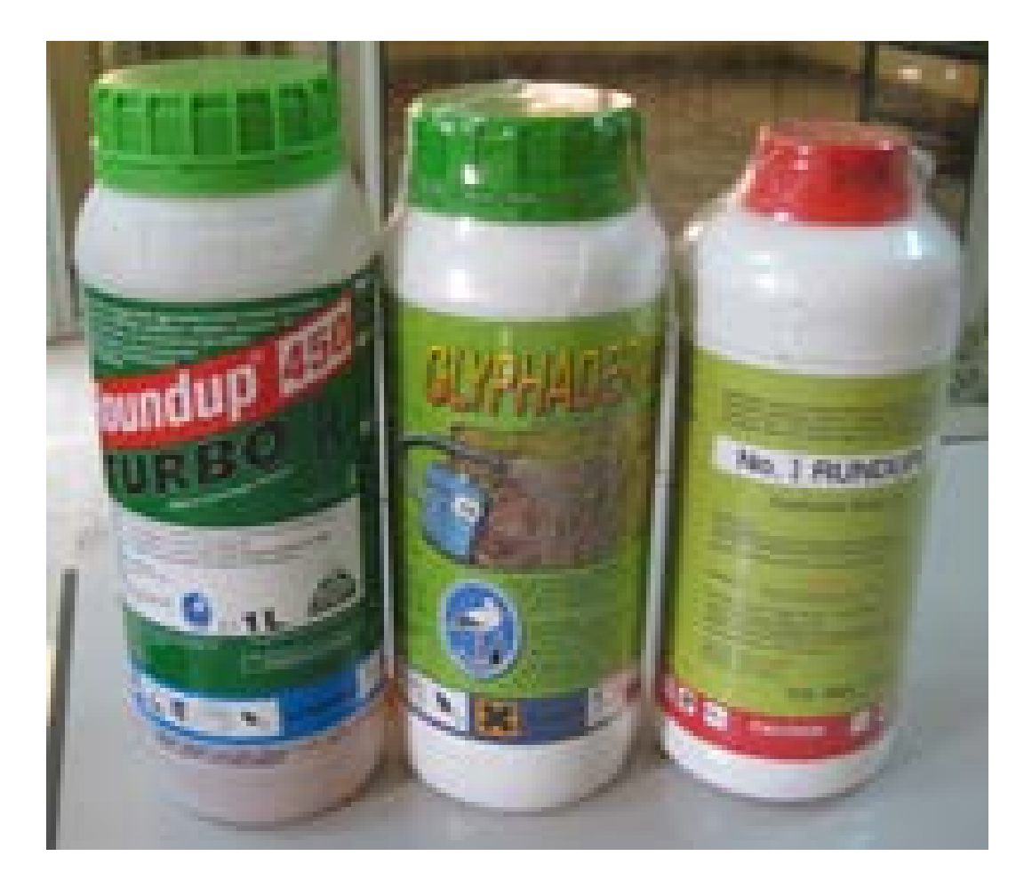
Figure 2. Roundup and early imitations