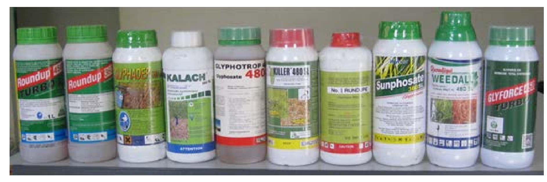
Figure 3. Roundup and imitations